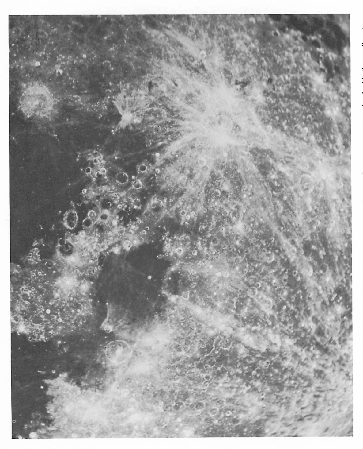
Fig. 2 Rectified view of the southern Mare Fecunditatis area showing the extensive ray systems associated with the small craters Furnerius A (right member of pair) and Stevinus A (left member of pair). The crater Rosse and its associated Tycho ray can be seen in Mare Nectaris (above and left of center).